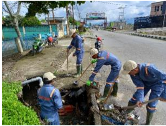
Figure 1. The Drainage Task Force Conducts Routine Maintenance

In Sungai Penuh City, the operation and maintenance of urban drainage systems fall under the responsibility of the Public Works and Spatial Planning Agency (Dinas PUPR). These activities are part of the sub-activity plan for the Operation and Maintenance of Drainage Systems. One of the key initiatives by Dinas PUPR in Sungai Penuh City is the establishment of a Drainage Task Force, whose duties include regularly cleaning the drainage channels.